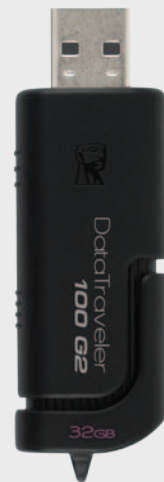
DataTraveler 100 G2