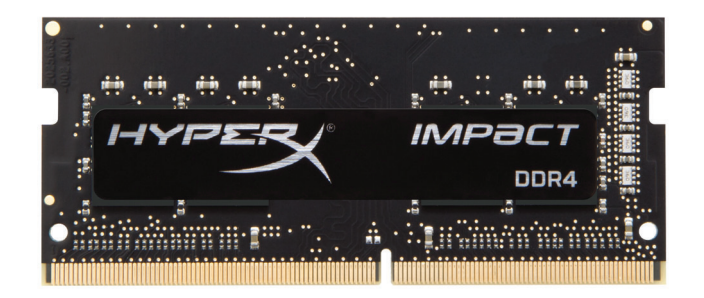
The product images shown are for illustration purposes only and may not be an exact representation of the product. Kingston reserves the right to change any information at anytime without notice.