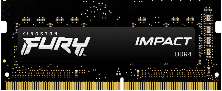
The product images shown are for illustration purposes only and may not be an exact representation of the product. Kingston reserves the right to change any information at anytime without notice.